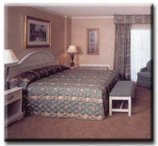
Four Points Sheraton