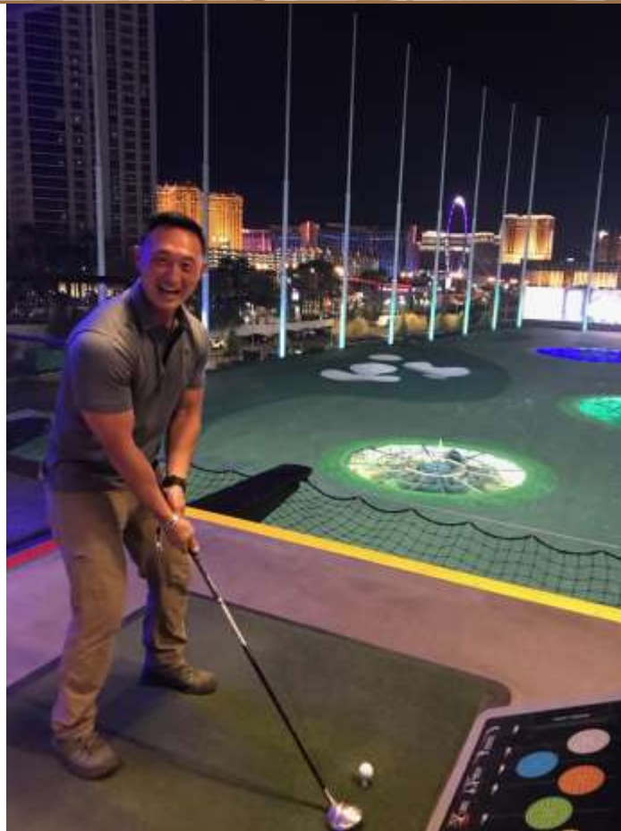
More Tee Time