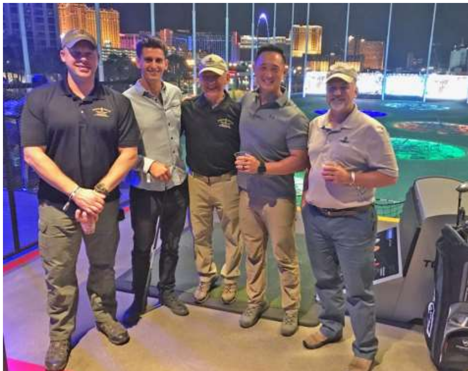
A good tee time was had by all.